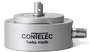
Vert-X 79 - 24V / CANopen, Certificates